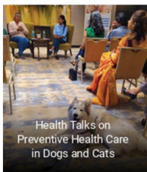
Health Talks on Preventive Health Care in Dogs and Cats