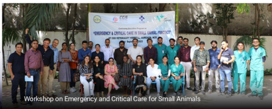
Workshop on Emergency and Critical Care for Small Animals